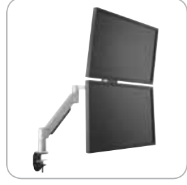
PFD 8523 + PFA 9102 Horizontal position